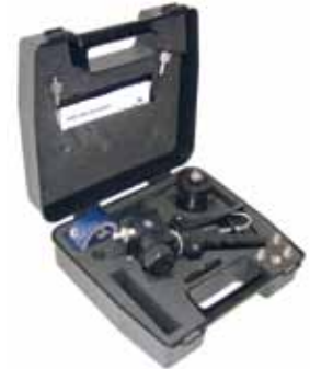
Pneumatic and hydraulic test kit