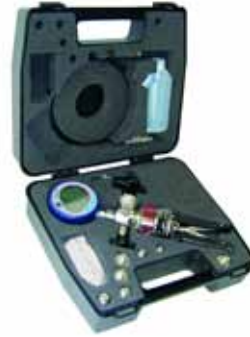
Hydraulic test kit

Includes: DPI 104; ranges to 15,000 psi (1000 bar), PV 212 hydraulic test pump, hose, adaptors, seal kit and case.