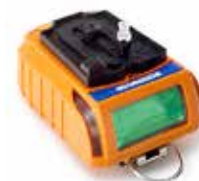
Pumped flow plate