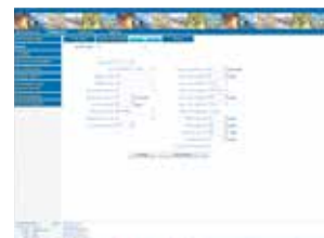
Portables Pro software