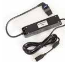
USB communications lead