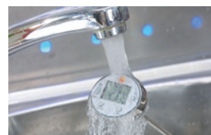
Simply rinse under running water when dirty.