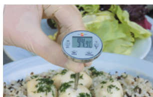
For temperature spot-check measurements in food production