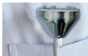
The protective sleeve with a clip holder. Always on you and ready to hand.