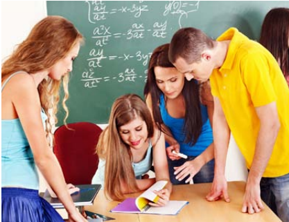
Indoor air quality