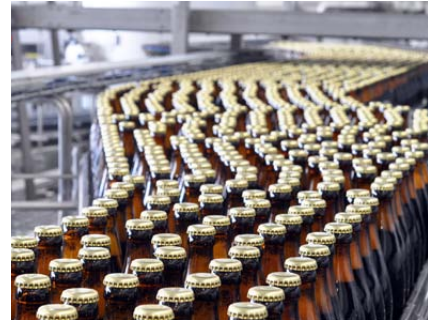
Leak monitoring in filling plants (safety)