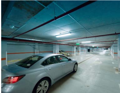
Monitoring in underground garages (safety)